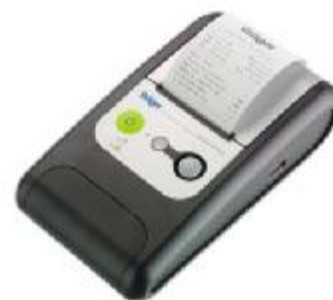
Printout of results